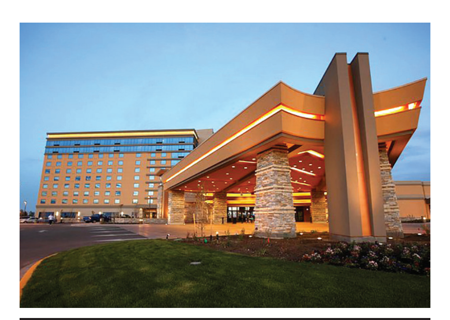
WILDHORSE RESORT AND CASINO